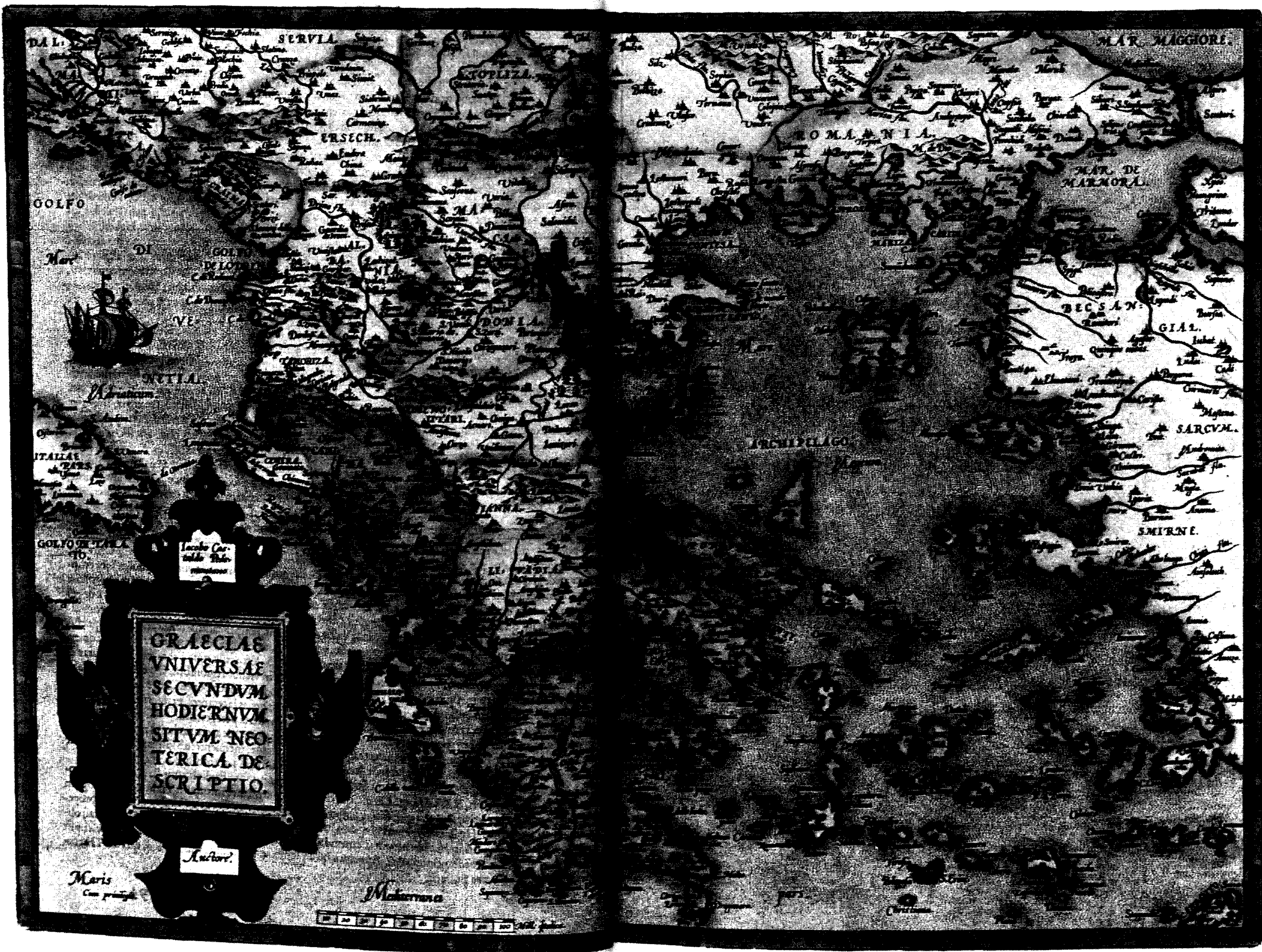
Map of Greece and the Aegean by Jacopo Gastaldi, c. 1575